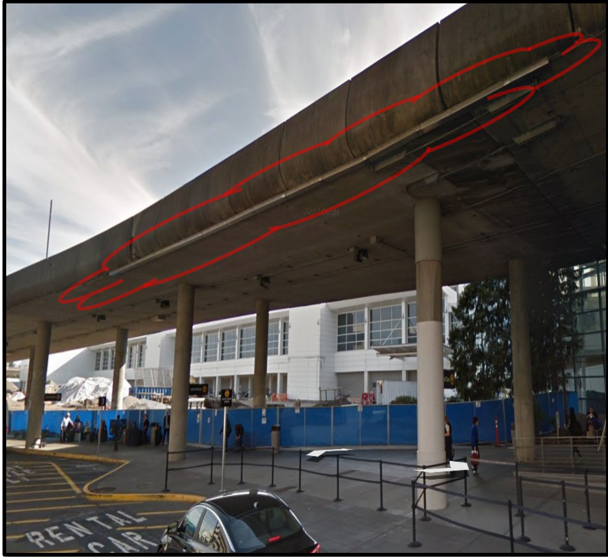
Leak Mitigation Gutter